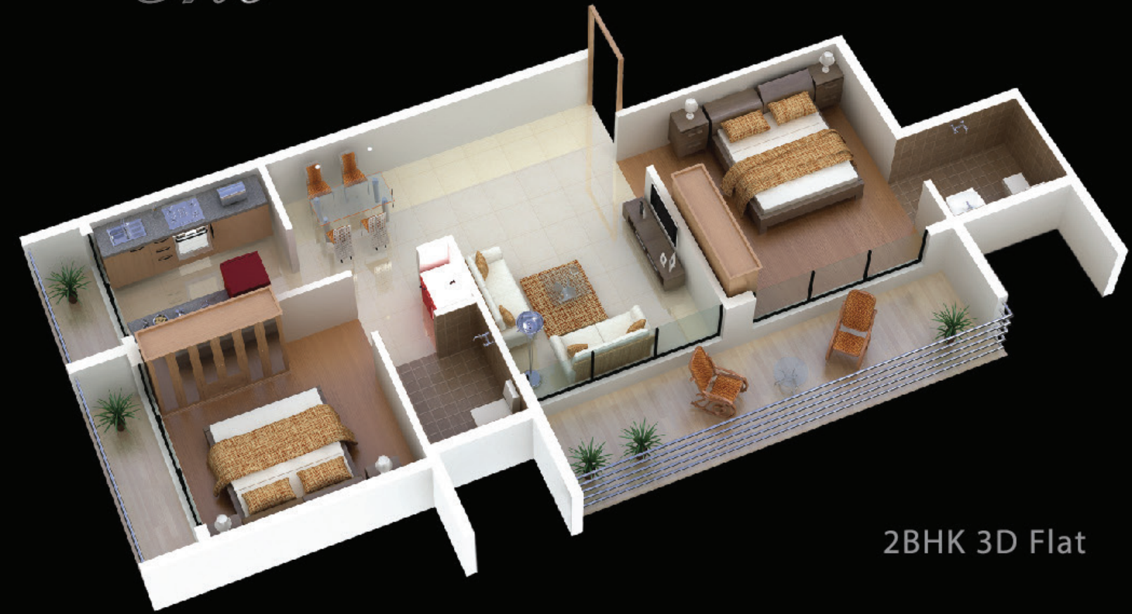
2BHK 3D Flat