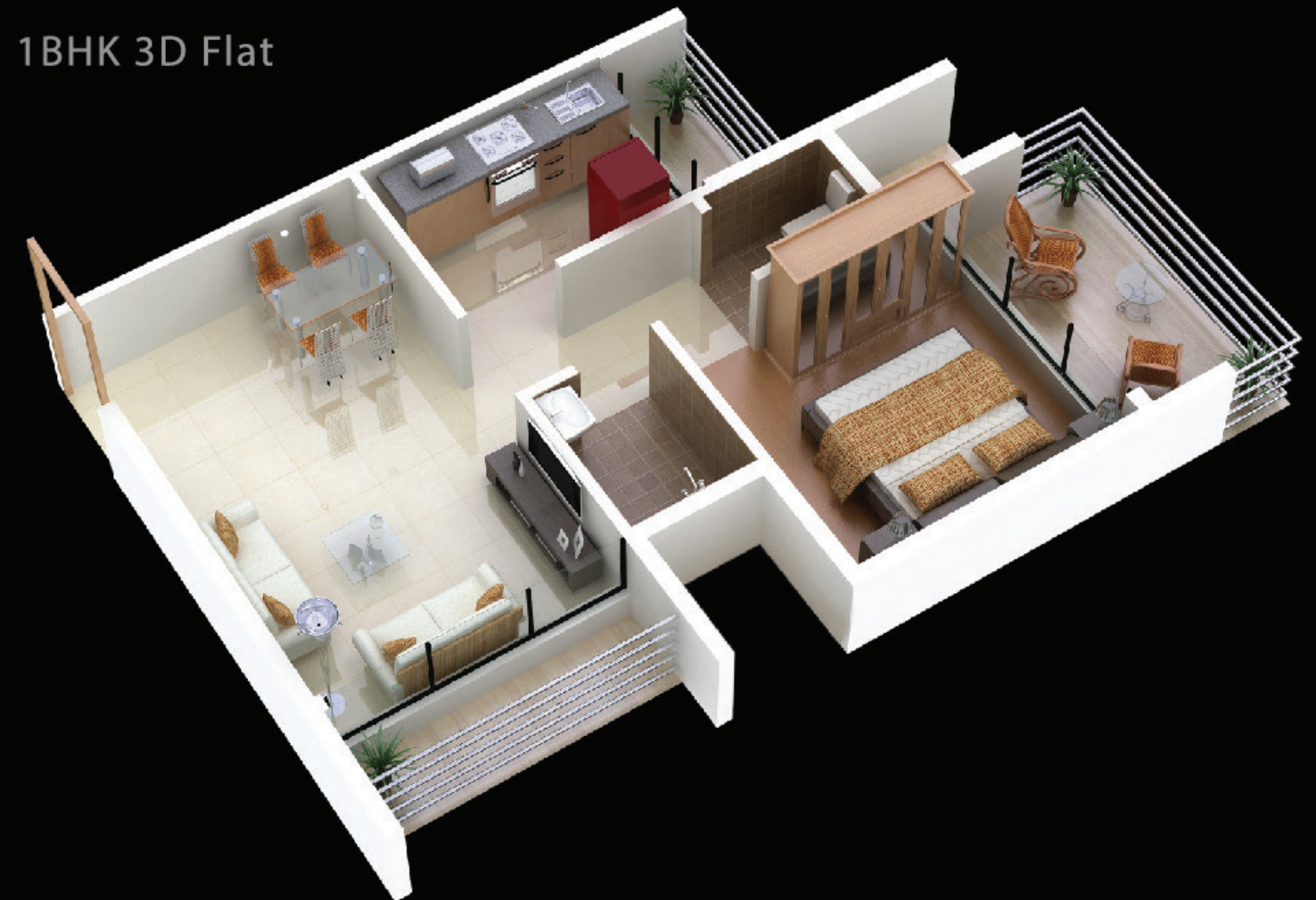
1BHK 3D Flat