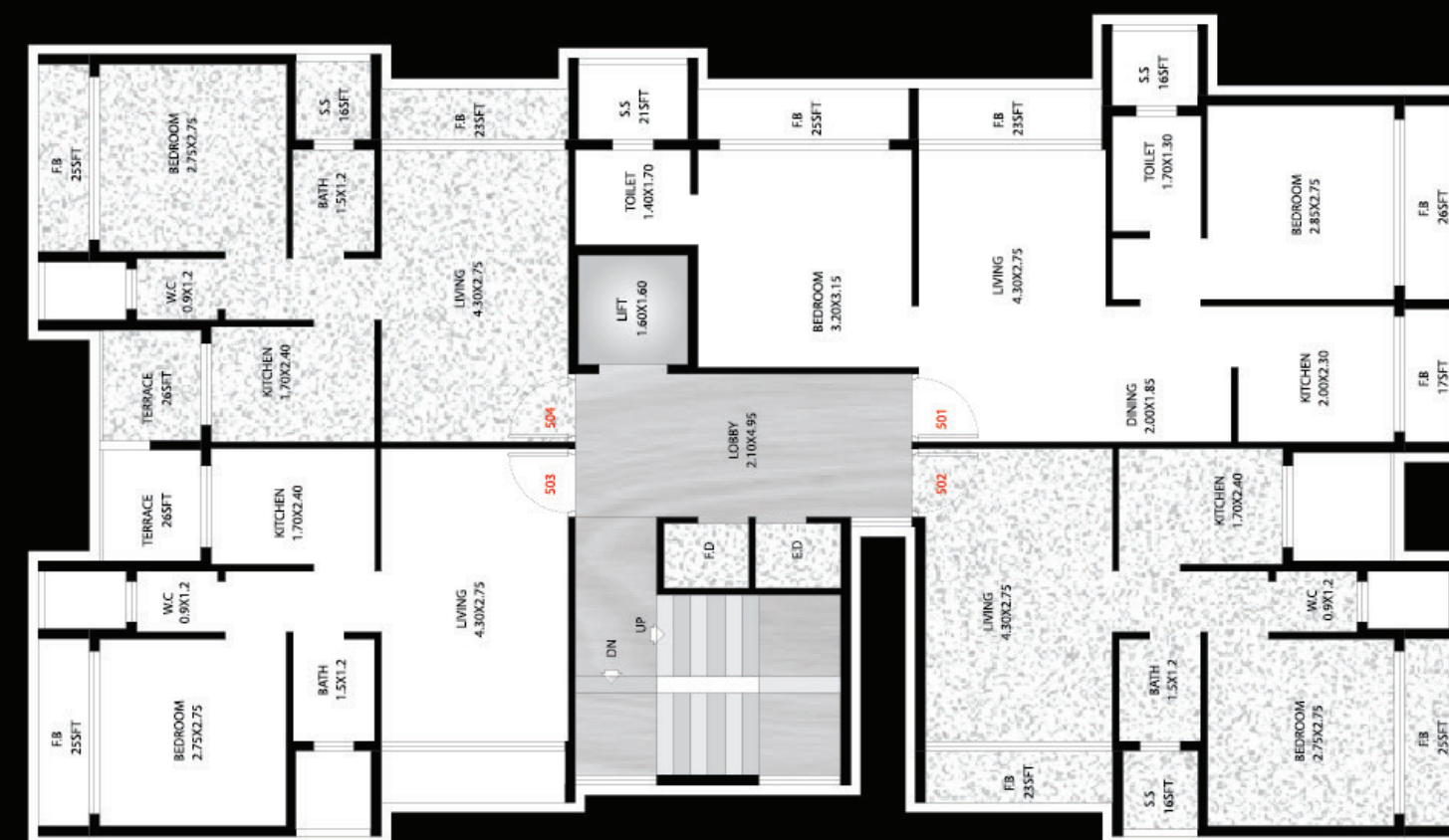
Fifth Floor Plan