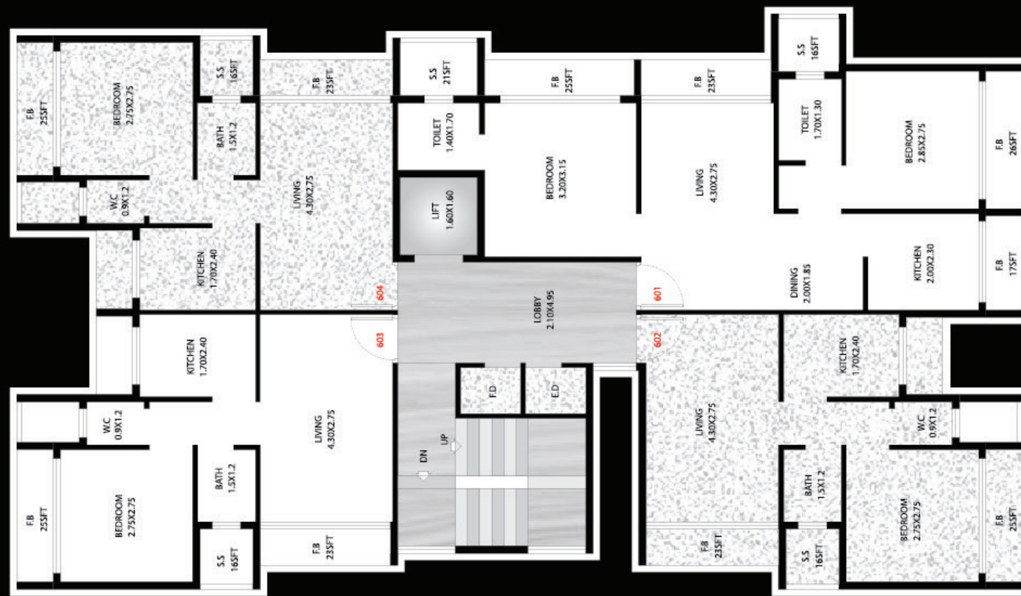
Sixth Floor Plan