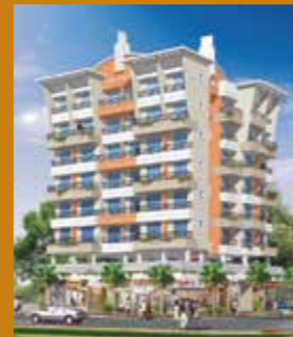
Shreeji Palms Kamothe - Navi Mumbai