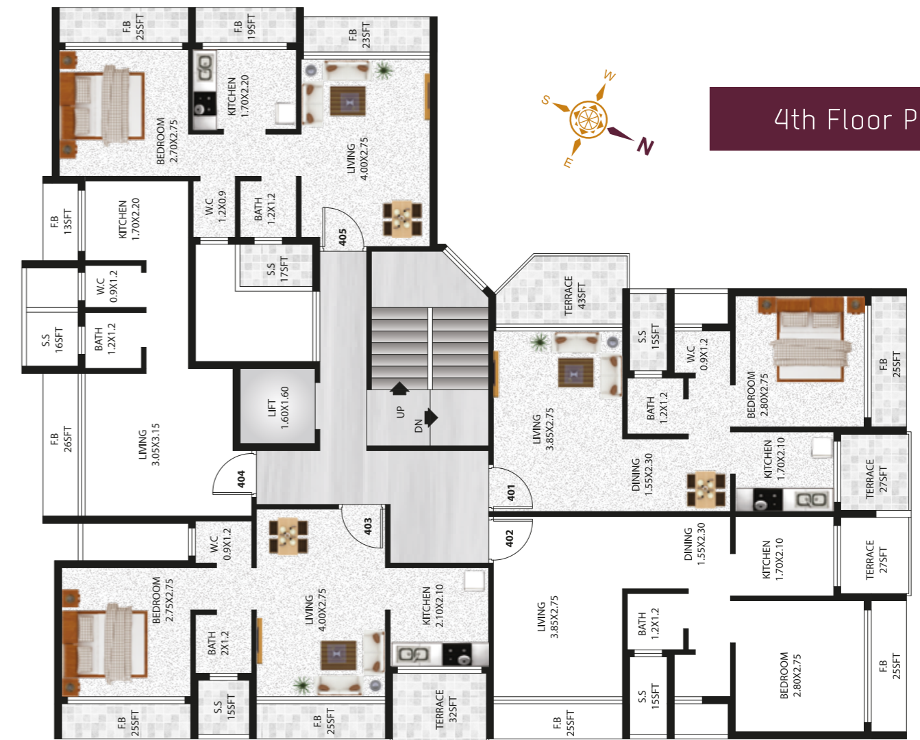
4th Floor Plan