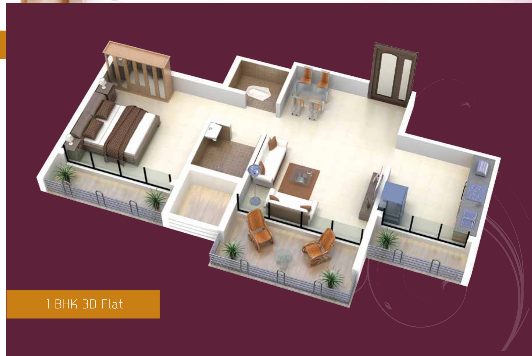
1 BHK 3D Flat