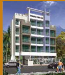
Shreeji Dreams Plot 19, Sec - 30, Talaja