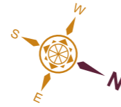
7th Floor Plan