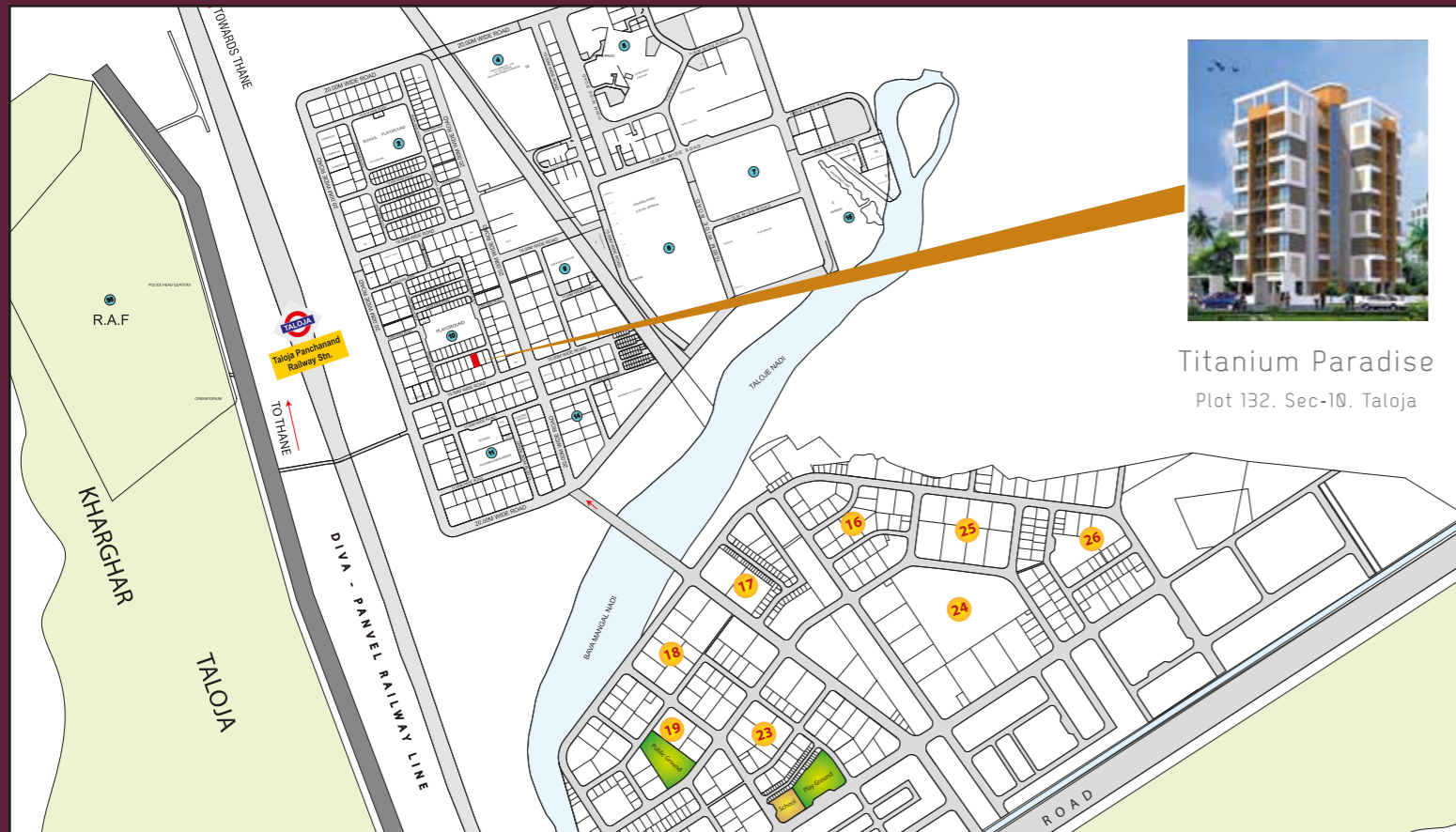
Titanium Paradise Plot 132, Sec-10, Talaja