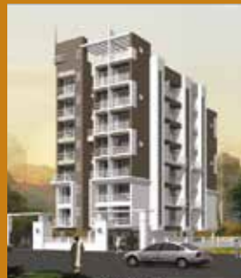
Titanium One Plot 40, Sec - 23, Ulwe