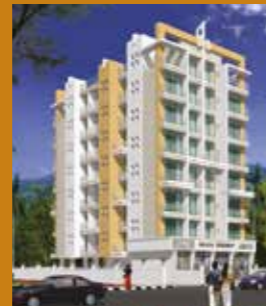
Shreeji Solitaire Talaja - Navi Mumbai