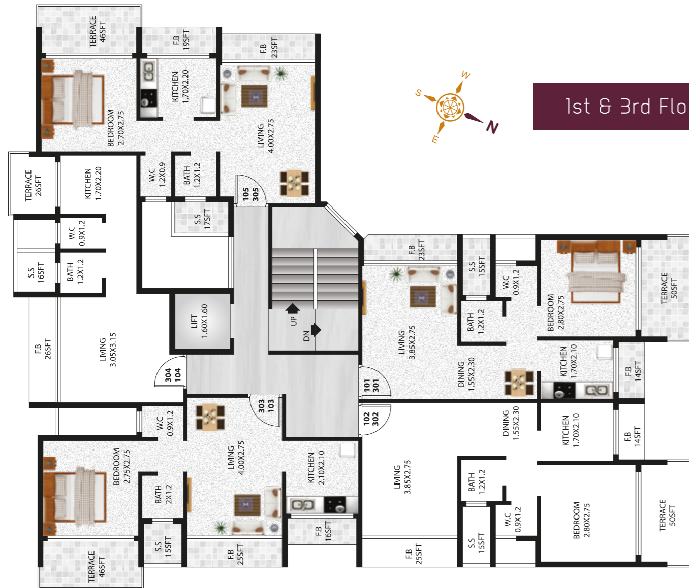
1st & 3rd Floor Plan